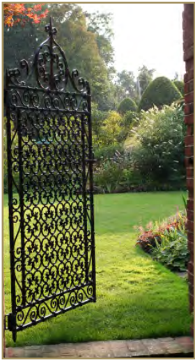
The Crowes' garden gate

As summer turns to autumn, the Fall issue of Preservation celebrates the beauty and history of our city, a city so richly deserving of our stewardship and preservation. Our focus is the largest and oldest historic district, the Lake Forest Historic District located in the easternmost part of the city. It is characterized by architecturally, significant homes, important cultural history and the natural beauty of the towering bluffs, wooded ravines and Lake Michigan frontage.