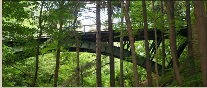
Walden Bluff's Edge Bridge rehabilitation, a Preservation Foundation project