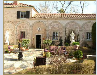
Charles Pike House & Courtyard on Lake Road

On April 28th, 250 members and friends joined us in Honoring 2013 Award Recipients & Exploring David Adler's Historic Pike House