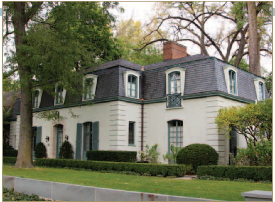
151 RIDGE LANE