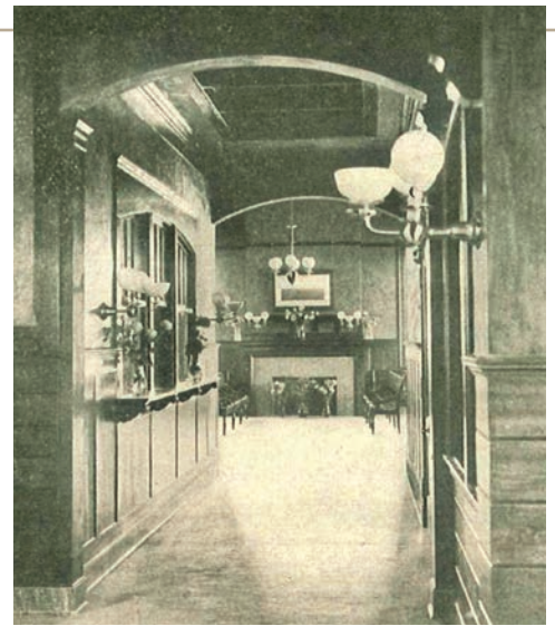
INTERIOR PHOTO OF LAKE FOREST TRAIN STATION IN 1901 SHOWS ORIGINAL CUSTOM LIGHTING AND HORIZONTAL WAINSCOTING.

Tax-deductible contributions to this important project can be made on the Foundation's website, www.LFPF.org , or by contacting the LFPF office at 847-234-1230 or info@lfpf.org .