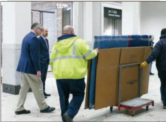
1857 Map arriving at the Newberry Library