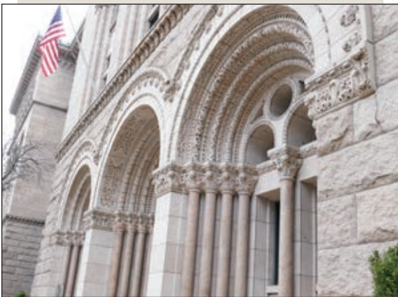
The Newberry Library