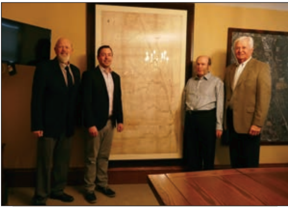
1857 Map at Lake Forest City Hall