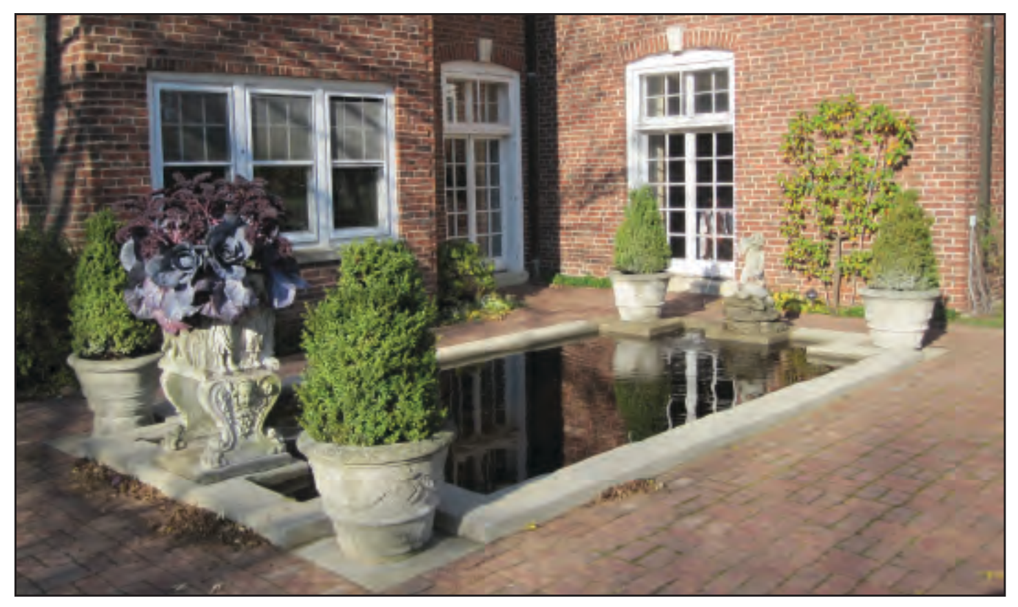
Just restored 1909 Glen Rowan reflecting pool, fountain, sculpture and containers and rejuvenated planting seasonal schemes all carried out by collaborating local experts and funders. October 2011.

Lake Forest, Illinois Volume 4, Number 3 Fall 2011