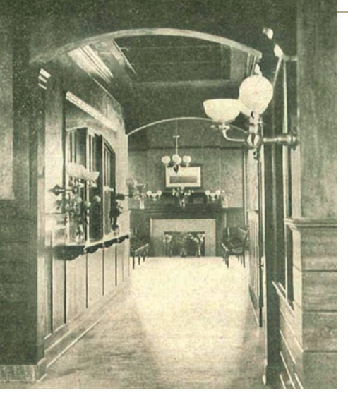
Interior photo of Lake Forest train station in 1901 shows original custom lighting and horizontal wainscoting.

Celebrating 40 years of LFPF and the exquisite renovation of the exterior of the East Lake Forest Train Station with the community.