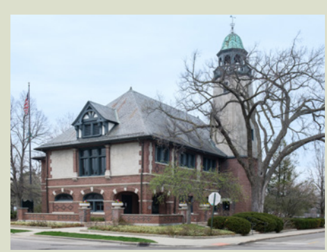
Lake Forest City Hall

Peregrine Bryant (see cover photo). Good ideas have emerged from the plan process, but they will require outstanding traditional architectural design to be effective, including paying above average fees to get above average results.